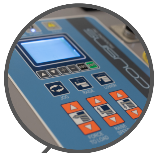
Improved Control Panel