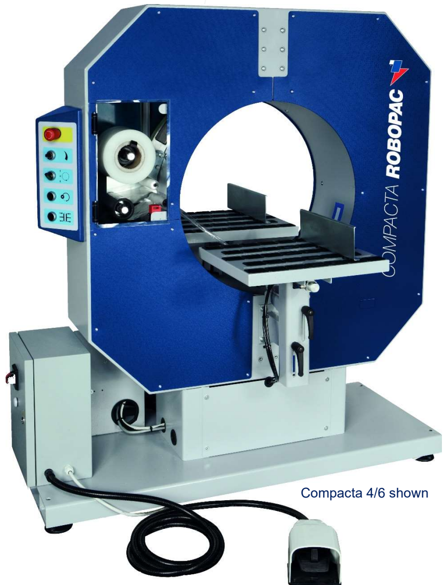
Compacta 4/6 shown

Safe, simple operation includes automatic film clamping and cutting. Compactas feature constant film tensioning to improve package integrity and reduce film breaks.